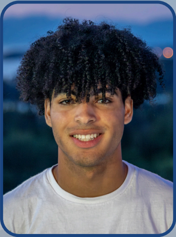
John Barsby Secondary

Sports: Basketball, Football, Track and Field