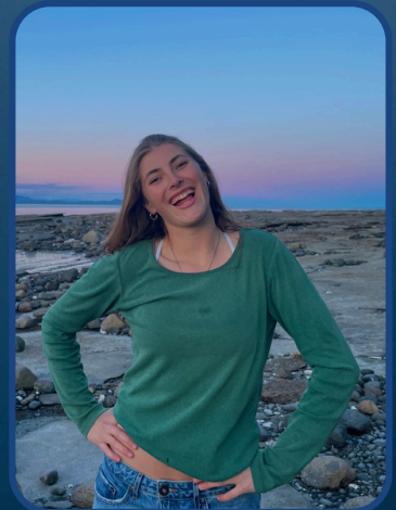
York House School