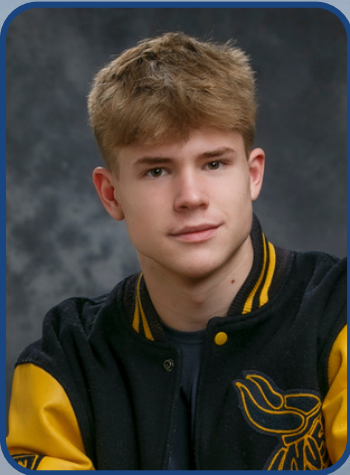
Nechako Valley Secondary

Sport: Basketball, Football, Soccer, Ultimate