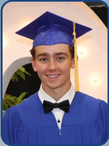
LV Rogers Secondary

Sports: Basketball, Cross Country, Track and Field