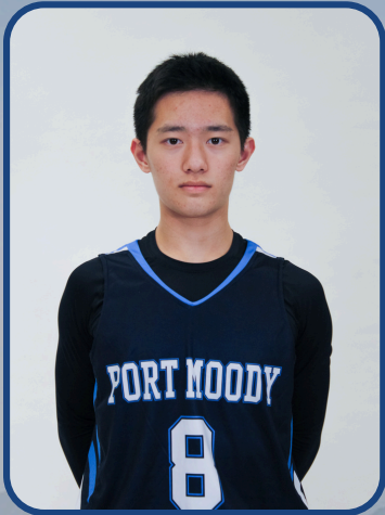
Port Moody Secondary

Sports: Basketball, Cross Country, Golf, Skiing, Track and Field, Ultimate