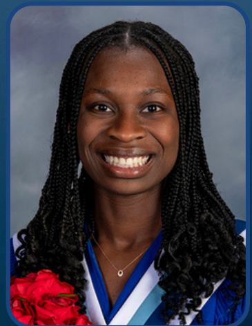
College Heights Secondary