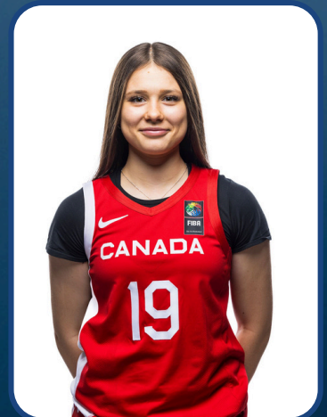
Ecole Riverside Secondary