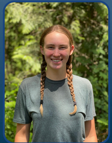
LV Rogers Secondary