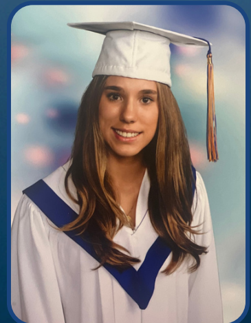
St. Ann's Academy