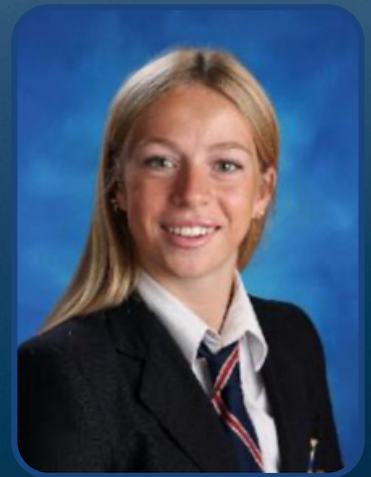
St Michaels University School