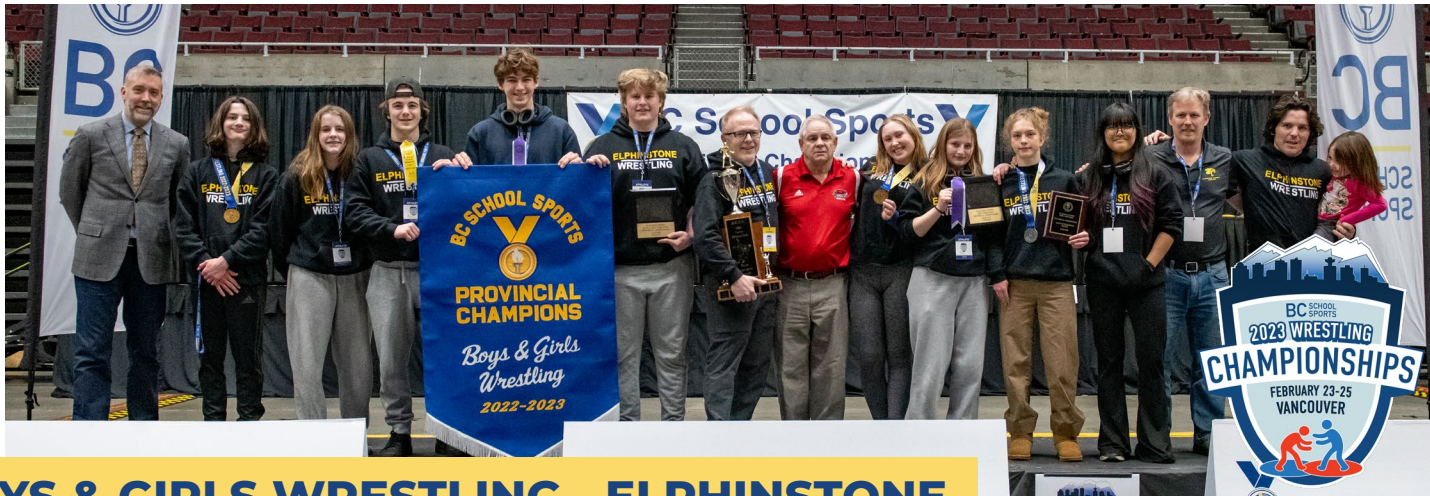
BOYS & GIRLS WRESTLING - ELPHINSTONE