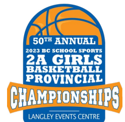
2A GIRLS BASKETBALL - MULGRAVE