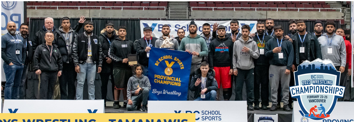
BOYS WRESTLING - TAMANAWIS