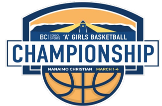
1A GIRLS BASKETBALL - CREDO CHRISTIAN