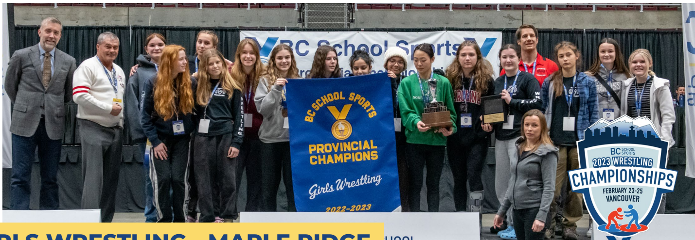
GIRLS WRESTLING - MAPLE RIDGE