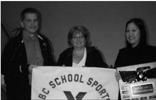
Prince of Wales Secondary, 2011 Outstanding School Award Winner

TO RECOGNIZE COLLEAGUES AND SCHOOLS WHO HAVE MADE A SIGNIFICANT CONTRIBUTION TO ATHLETIC PROGRAMS WITHIN THE SECONDARY SCHOOL SYSTEM IN BRITISH COLUMBIA.