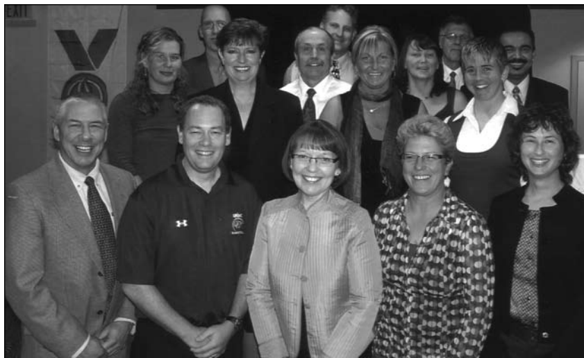
BC SCHOOL SPORTS Coaching Recognition Dinner October 24, 2008

To recognize colleagues and schools who have made a significant contribution to athletic programs within the secondary school system in British Columbia.