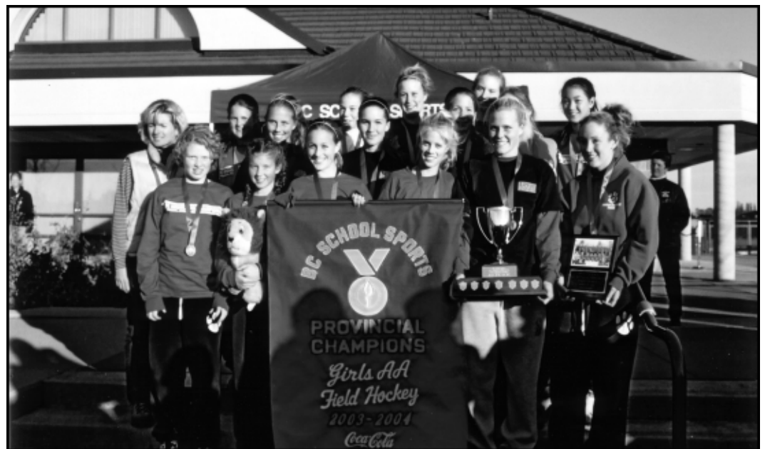
2003-2004 BCSS Provincial Girls AA Field Hockey Champions: Cowichan Secondary, Duncan