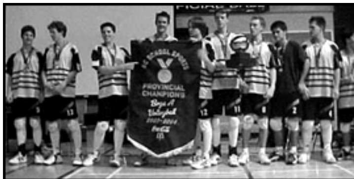
2003-04 BCSS Provincial Boys A Volleyball Champions: Agassiz Secondary