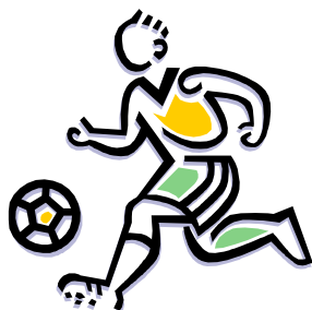
2003-04 BCSS Provincial Boys AA Soccer Champions: Lambrick Park Secondary, Victoria