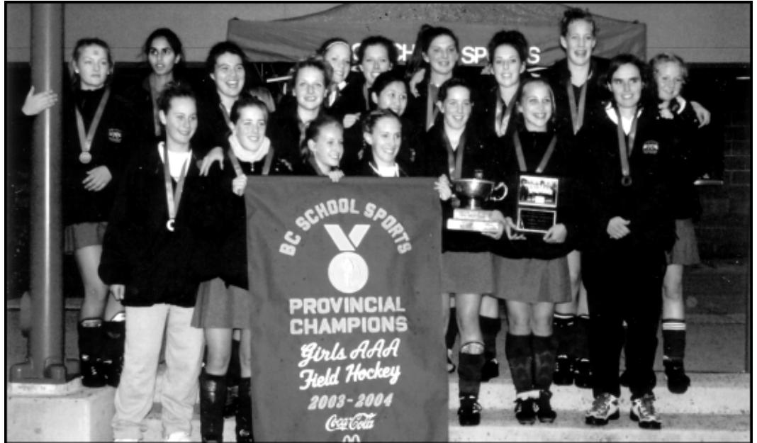
2003-2004 BCSS Provincial Girls AAA Field Hockey Champions: Lambrick Park Secondary, Victoria