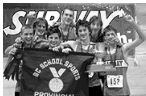
2003-04 BCSS Provincial Boys Cross Country Champions: Oak Bay Secondary, Victoria