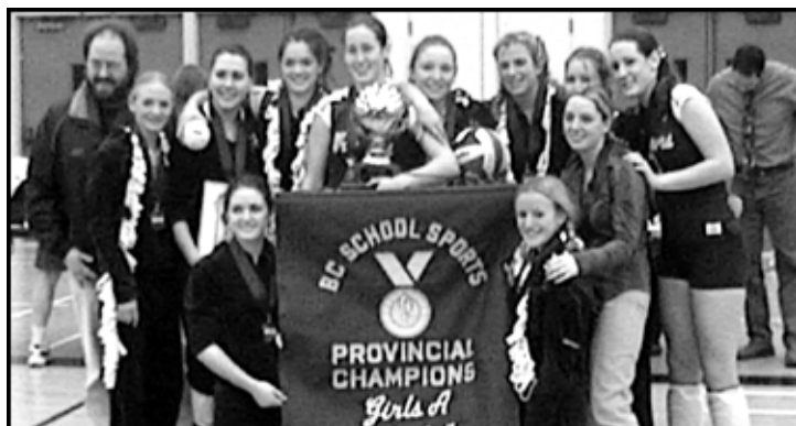
2003-04 BCSS Provincial Girls A Volleyball Champions: White Rock Christian Academy, Surrey