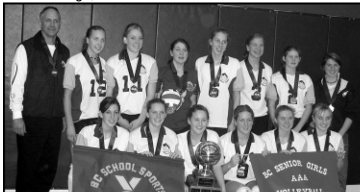
2003-04 BCSS Provincial Girls AAA Volleyball Champions: Ballenas Secondary, Parksville