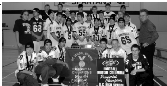
2003-04 BCSS Provincial AA Football Champions: Sentinel Secondary, West Vancouver