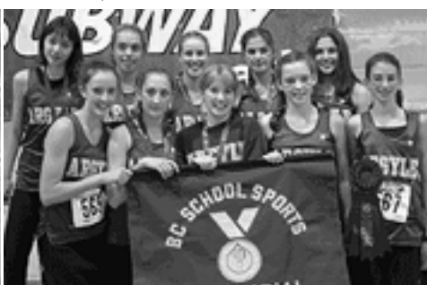
2003-04 BCSS Provincial Girls Cross Country Champions: Argyle Secondary, North Vancouver