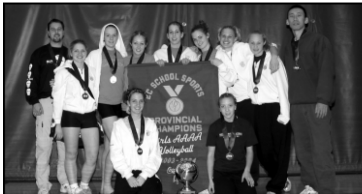
2003-04 BCSS Provincial Girls AAAAA Volleyball Champions: Prince George Secondary