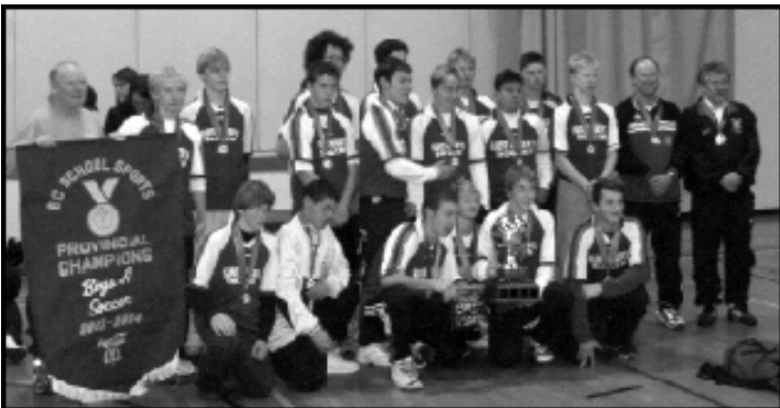
2003-04 BCSS Provincial Boys A Soccer Champions: St. Andrew's Regional School, Victoria