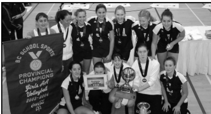
2003-04 BCSS Provincial Girls AA Volleyball Champions: Kalamalka Secondary, Vernon