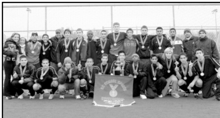
2003-04 BCSS Provincial Boys AAA Soccer Champions: Alpha Secondary, Burnaby